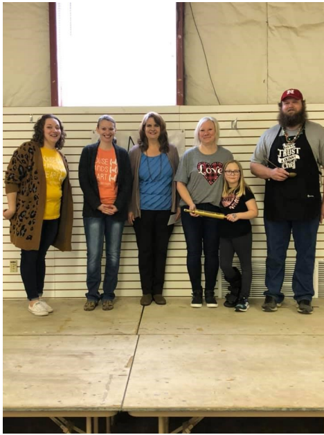
Minden MOPS Chili Cookoff Winners